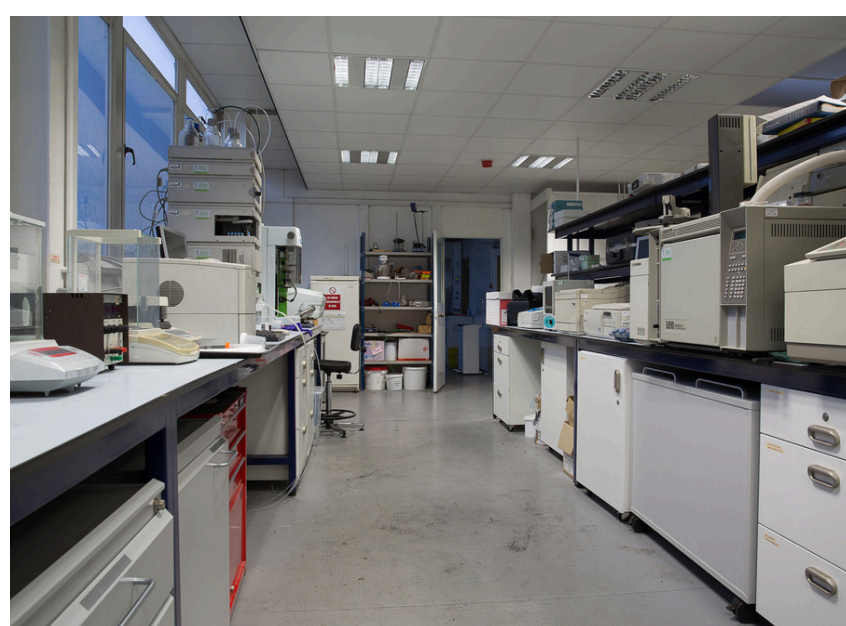
ANCILLARY TOOL ROOMS